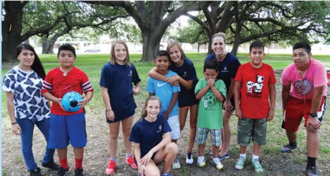
Volunteers lead camps, provide & serve meals, work in our office, collect much needed supplies and bring hundreds of smiles to WHP kids each and every year.